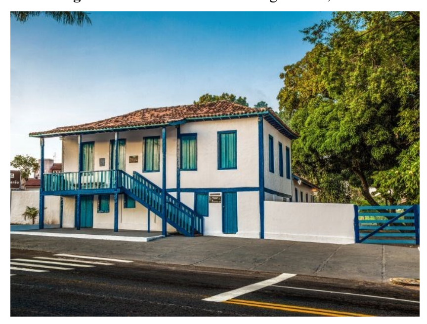
Figure 3: A Picture of the Gonzaga Estate, 2023.