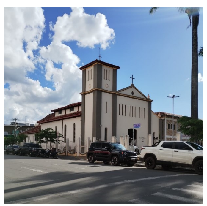
Figure 2: Parish Church Our Lady of Sorrows

In 1853, the church was completed and baptized as Nossa Senhora dos Desterros (Our Lady of Exile). In 1888, under the vicary's superstition, it had its name altered to Igreja Nossa Senhora das Dores (Church Our Lady of Sorrows, as shown in Figure 1), which remains standing in the central area of the city (Ferreira, 1958); during renovations conducted in 1928, one of its towers was removed due to the scarcity of resources available to be employed in the restoration. Nowadays, the Parish Church Our Lady of Sorrows is preserved such as can be observed in Figure 2.